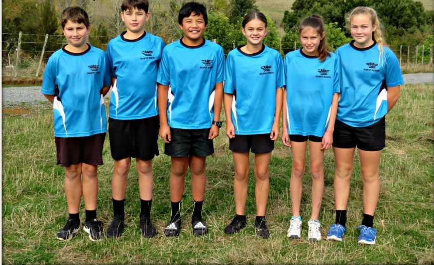
Franklin Zone Orienteering 2019 Year 7/8 Mixed Group 1