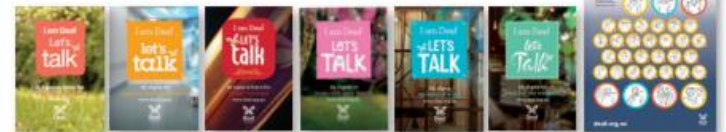
'Let's Talk' 25 signs booklets