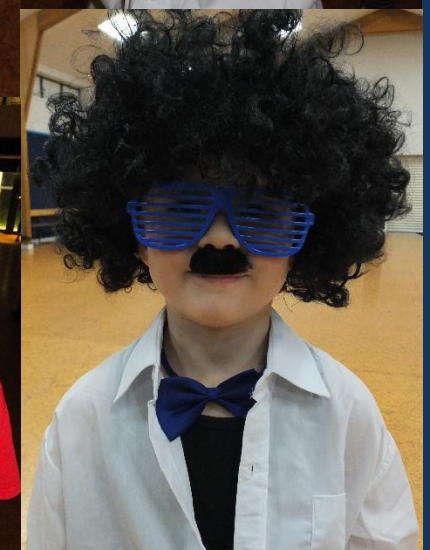
Left: The senior class has been thinking about bullying.